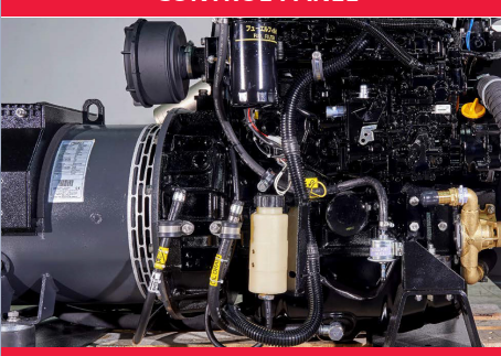
YANMAR 1500 RPM ENGINE