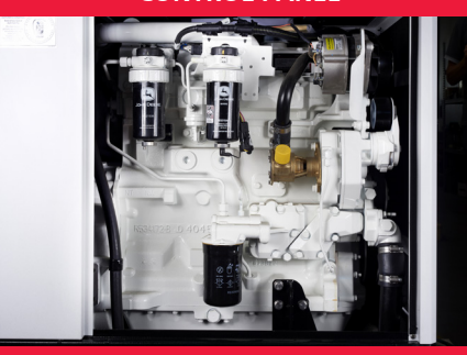
JOHN DEERE ENGINE