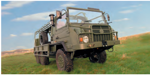
See more applications on our website or contact us for further references.